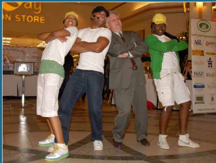
Mayor Barrow Gets Down At Character Community Day

Next Month's Attribute: January is Optimism