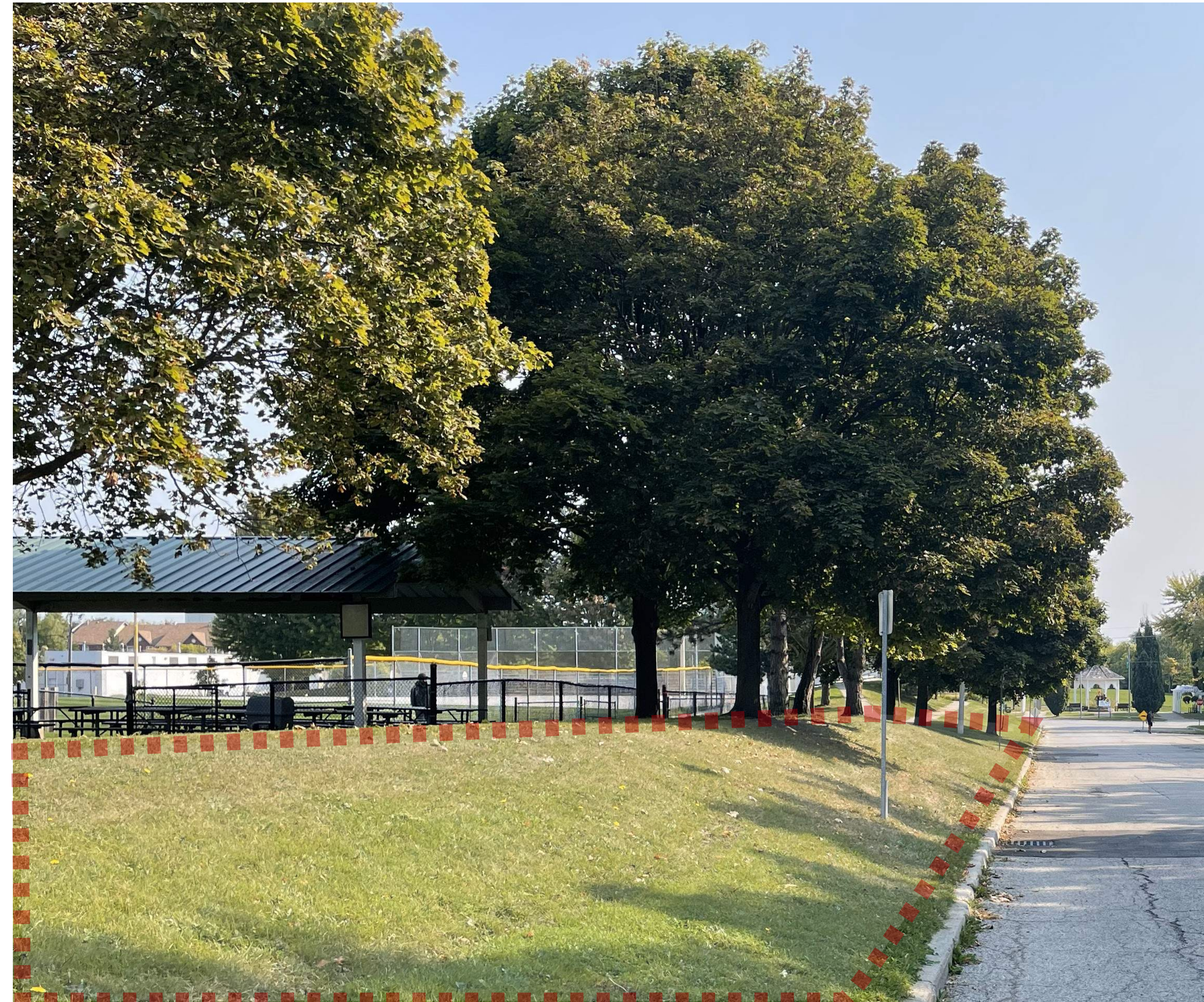
Existing Landscape Berm Looking East on Vern Dynes Ave.