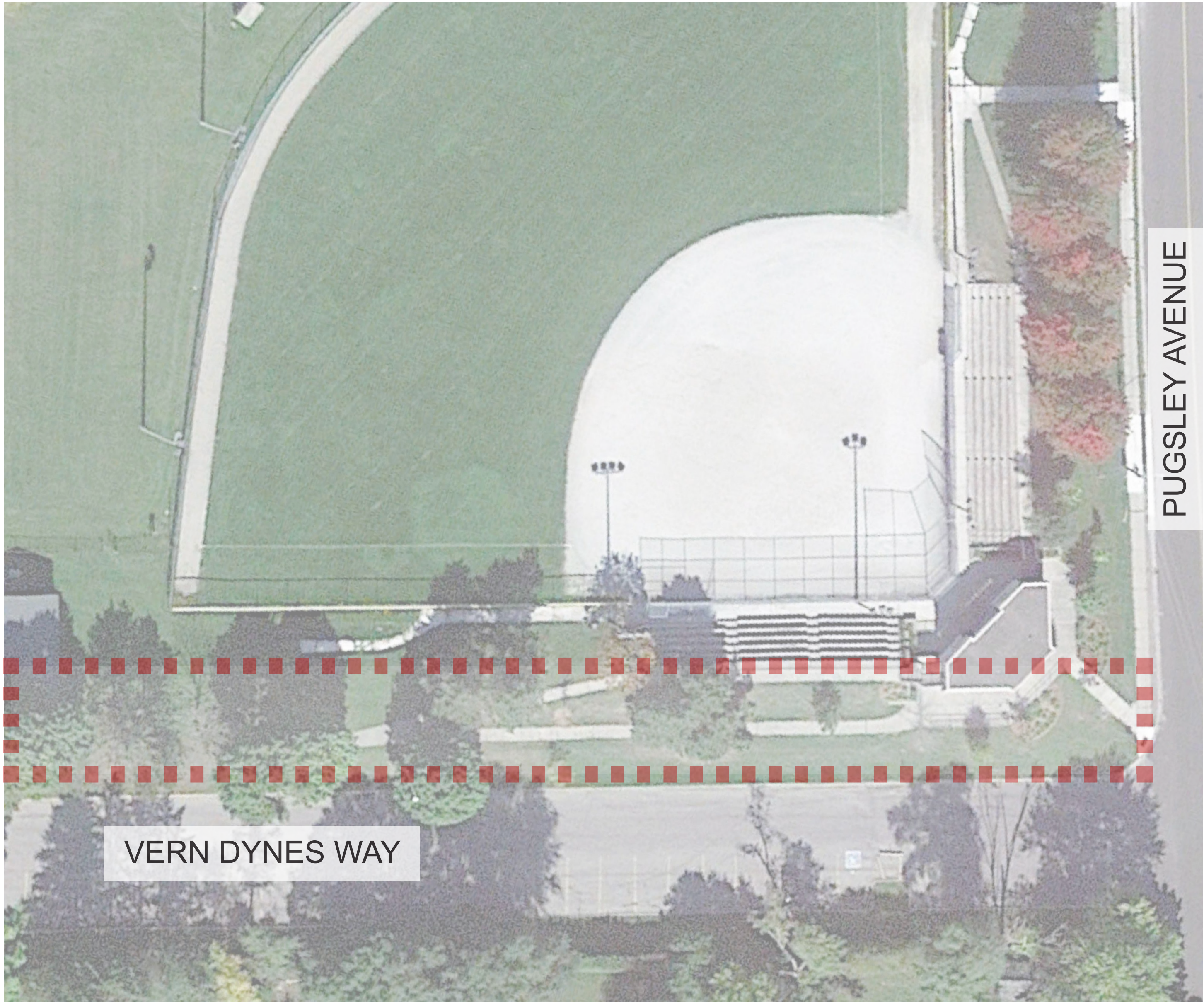
Aerial View of Existing Landscape Berm