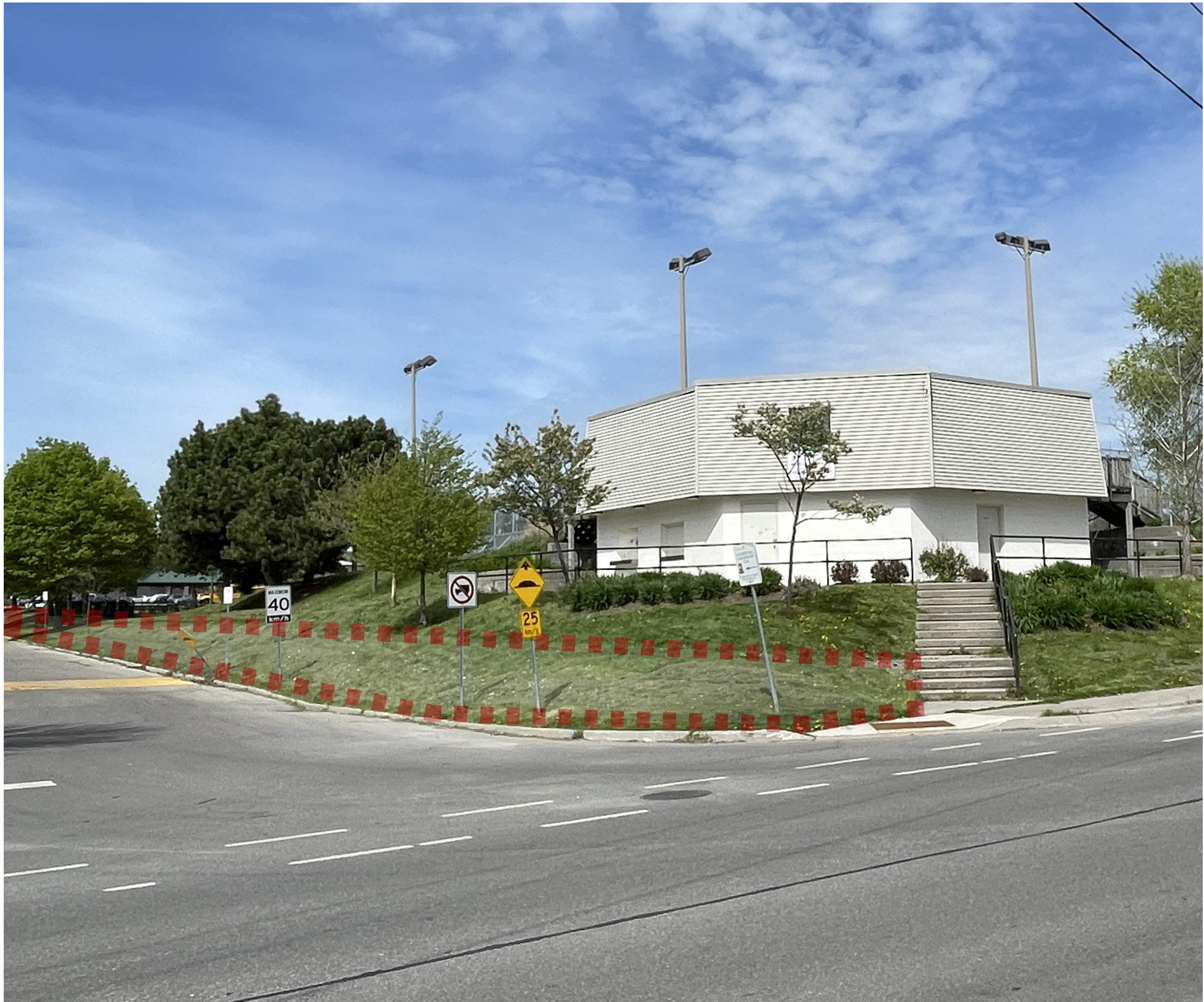
Existing Landscape Berm Looking West from Pugsley Ave.